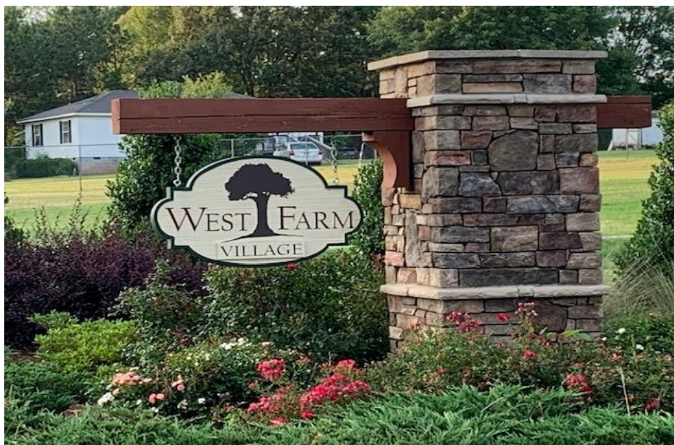
West Farm Subdivision, Fountain Inn, SC