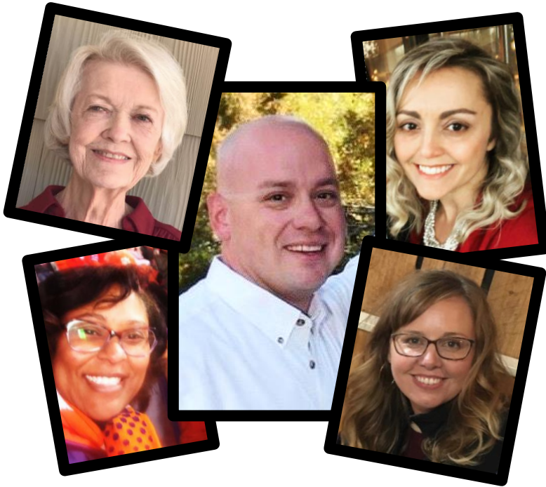
West Farm Board Members