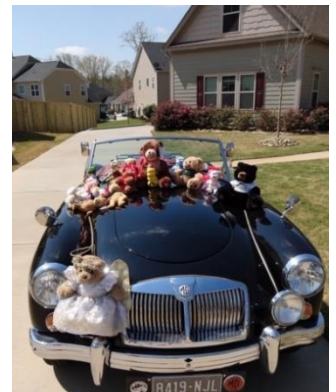
BEARY GOOD RIDE