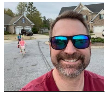
"WE HAD SO MUCH FUN"