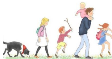
MAR 27 - MAR 29