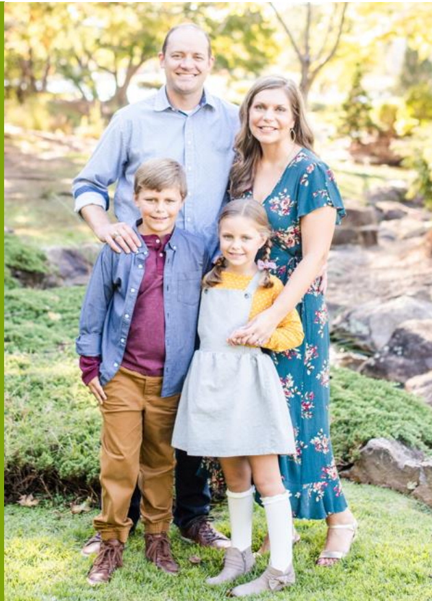
THE CABE FAMILY

This is not intended to be a full listing of pool rules. Please refer to the HOA website for full listing.