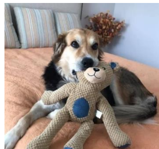
THIS BEAR WAS TAKEN