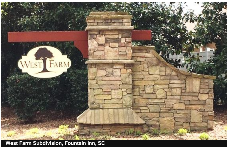
West Farm Subdivision, Fountain Inn, SC